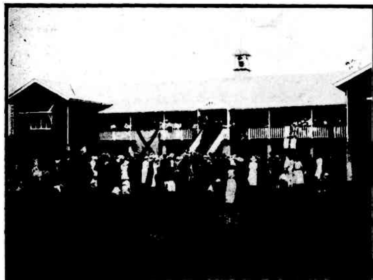
THE NEW STATE SCHOOL AT NEWTOWN, TOOWOOMBA. The official opening took place on October 4.